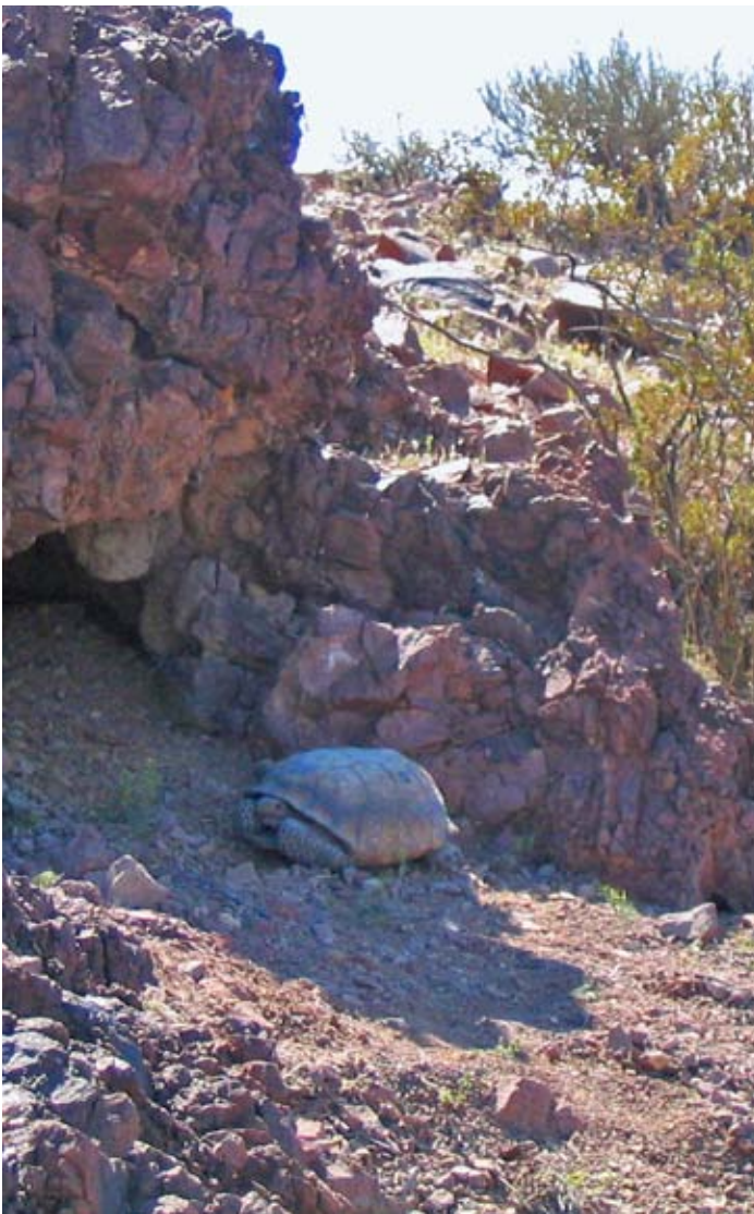
DESERT TORTOISE RECOVERY OFFICE, U.S. FISH AND WILDLIFE SERVICE

The four broad strategies for greater effectiveness and efficiency of endangered species policy presented in this white paper are not Defenders’ only strategies, but they are among the most important and reflect our value judgements and priorities. We share them to provide a better understanding of our work and our approach to improving implementation of the ESA, our best tool for shaping the future of wildlife conservation in America.