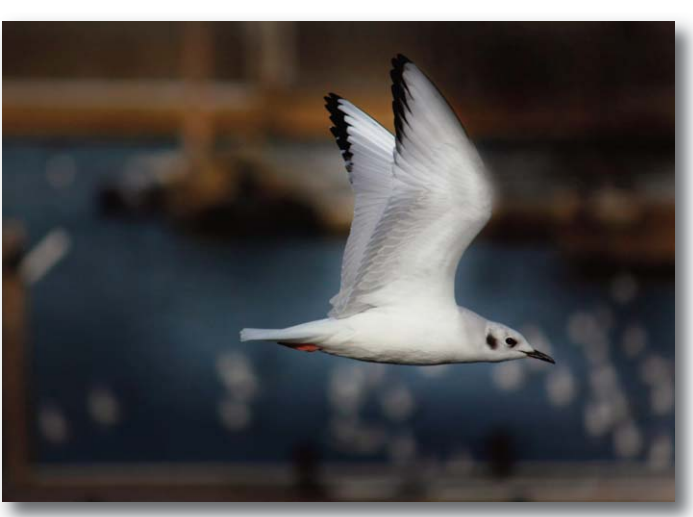
A Bonaparte's gull in flight along Lake Erie, New York.