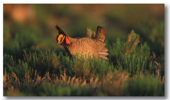
Lesser prairie chicken in Eastern New Mexico.

WRP was originally authorized with a cap of 1 million acres, but this figure was expanded to 2.275 million acres in the 2002 Farm Bill (P.L. 107-171) and to 3.041 million acres in the 2008 Farm Bill. As of the program's 20-year anniversary in 2012, 2.3 million acres had been enrolled in WRP, with individual easements ranging from 2 acres to 26,000 acres in size, including habitat for federally listed threatened and endangered species including whooping cranes, wood storks, and bog turtles, as well as scores of species of migratory waterfowl, wetland-specific plants, and other species (NRCS 2012b). The 2014 Farm Bill does not explicitly stipulate an acreage cap, but instead sets a funding limitation for the entire easement program as described above.