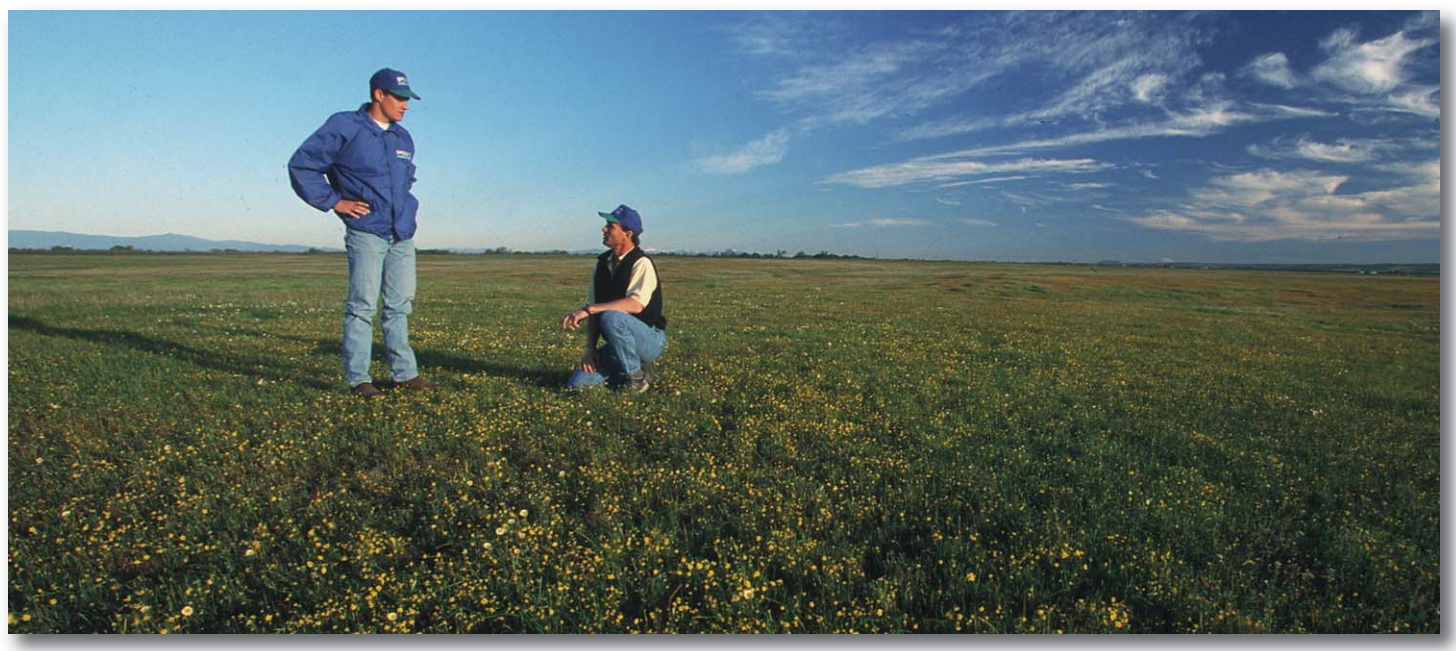
Vernal pool wetland in Northern California.

environmental problems, the CSP model pays enrolled producers for "conservation performance" as measured across the entire farm or forestry operation. It represents the first attempt within U.S. farm policy to implement a "green payments" program; that is, to shift agriculture support away from commodity subsidies, which have been criticized for distorting prices and thus interfering with open-market and free-trade principles (Dodd et al. 2005). Green payments are widely considered to be less inclined to challenges from the World Trade Organization than commodity payments. Legislative text specified that resources on enrolled lands were to maintain a "non-degradation standard," defined as the "level of measures required to adequately protect, and prevent degradation of" those resources.