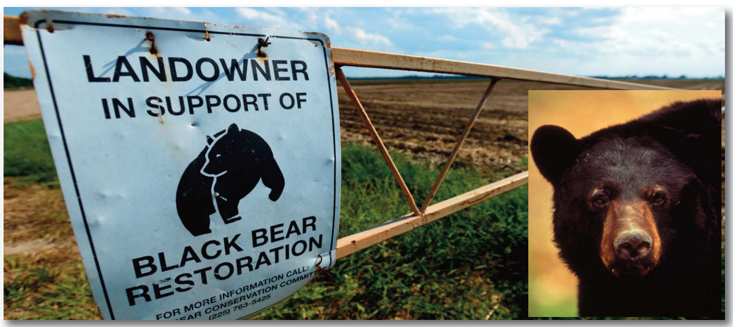
Wildlife habitat farm sign in Newellton, Louisiana. Right image: American black bear in Great Dismal Swamp National Wildlife Refuge, North Carolina.

The Conservation Stewardship Program (CSP) was originally authorized in the 2002 Farm Bill (P.L. 107-171) under the name "Conservation Security Program," and represented a new direction in working lands conservation assistance. Whereas the EQIP program provides funds for the enactment of structures and practices to correct