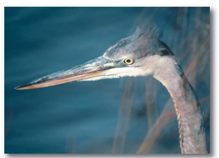
A great blue heron waits for his dinner on Maryland's Eastern Shore.

The Chesapeake Bay is 200 miles long, fed by over 50 rivers and countless small streams, and drains 64,000 square miles of land stretching from New York to Virginia (CBF, undated). Home to 17 million people and 84,000 farms, it should probably come as no surprise that the Bay has had its share of pollution problems. The watershed contains 92