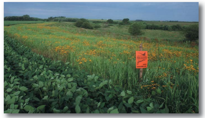
Native grasses and forbs in a conservation buffer along Bear Creek in central lowa.

nlike the easement programs, which take land out of production or place restrictions on its use for a defined period of time, the working lands programs offer assistance to make changes on lands that remain in production, for the furtherance of conservation goals. Like the easement programs, several changes and consolidations are proposed in the 2014 Farm Bill.