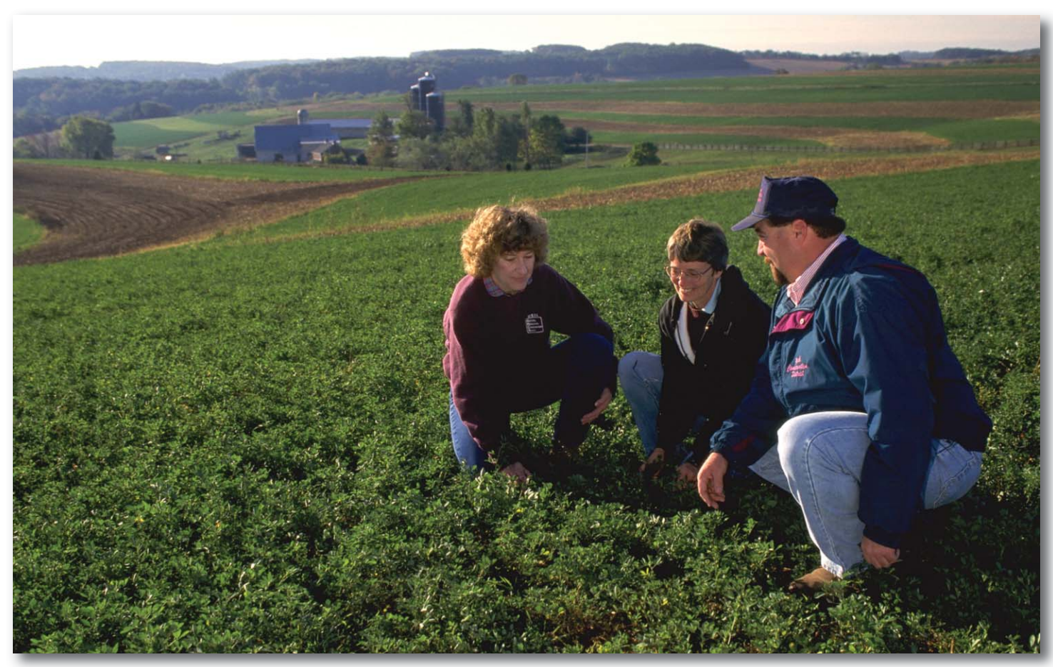
Landowner and NRCS conservationist working together in northeastern South Dakota.

(http://www.defenders.org/publications), highlights the ways that programs have addressed important priorities, and offers implementation recommendations to further improve this process.