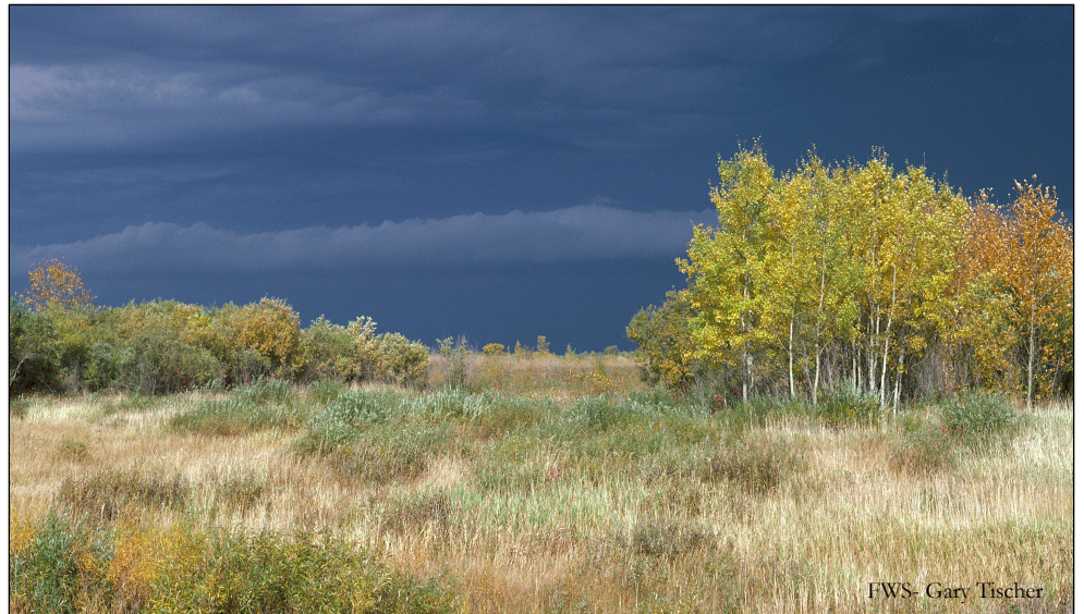
Agassiz National Wildlife Refuge

Prescribed fire will be used to manipulate the cattle within a 3,000-acre fenced area. The work has to be started now because by 2012, Glacial Ridge Refuge will be responsible for more than 24,000 acres.