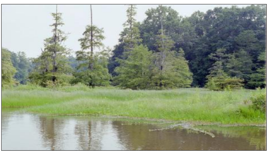
Choctaw National Wildlife Refuge, Alabama

Endangered Red-cockaded Woodpeckers (RCW) once thrived at Mountain Longleaf National Wildlife Refuge. Now, due to budget cuts, the entire biological program will be lost, along with the opportunity for RCW reintroduction and the oversight of 15 threatened and endangered species.