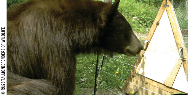
A black bear is about to find out that this chicken coop is protected by a newly installed electric fence.