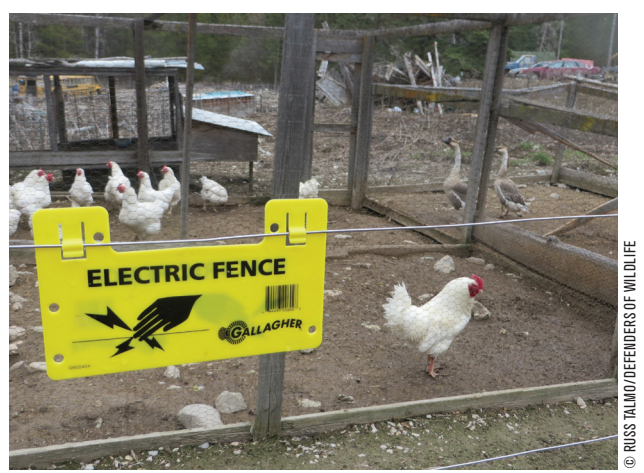
Carefully designed and properly installed electric fencing is a simple and effective deterrent to bears drawn to your property by chickens and other attractants.

efenders of Wildlife's Electric Fence Incentive Program comes to the Kenai Peninsula and Southeast Alaska with nearly a decade of success behind it. Since 2010, the program has supported over 500 electric fencing projects in Alaska, Montana, Idaho, Wyoming and Washington, defusing conflict and protecting people, property and bears.