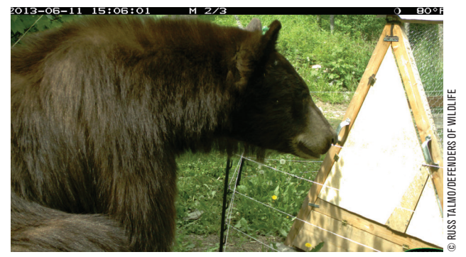
A black bear is about to find out that this chicken coop is protected by a newly installed electric fence.