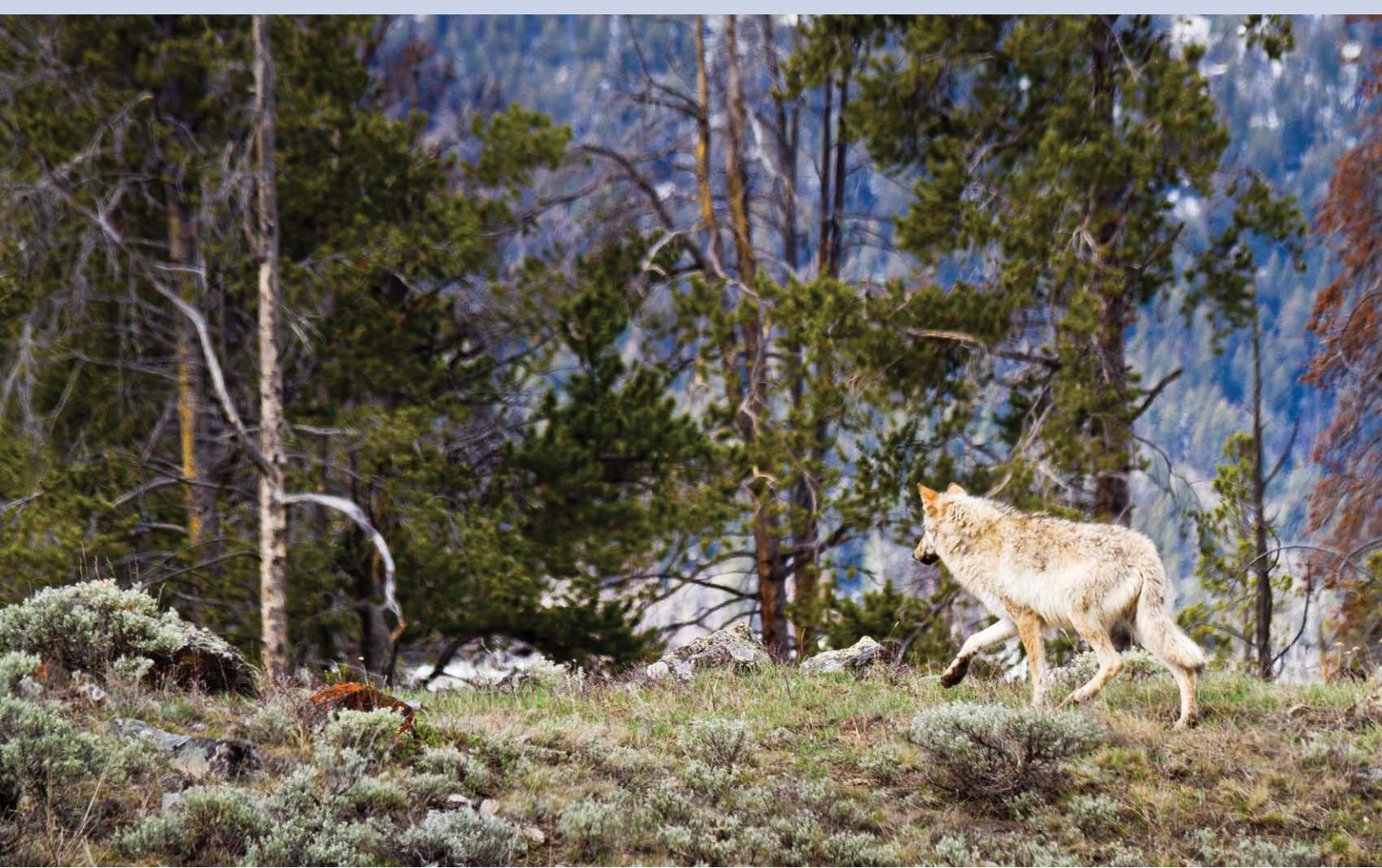
LAMAR VALLEY, YELLOWSTONE NATIONAL PARK

olf conservation is at a crossroads. The U.S. Fish and Wildlife Service (FWS), states and others are making decisions critical to existing populations of our nation's native wolf species and to efforts to restore them in additional areas.